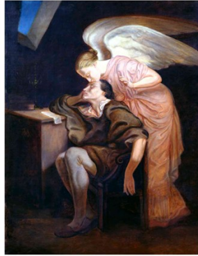
Paul Cezanne. Dream of the Poet, Kiss of the Muse . Circa 1850. Oil on canvas. 82 x 66 cm. Musée d'Orsay.