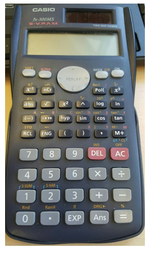
Casio Scientific Calculator