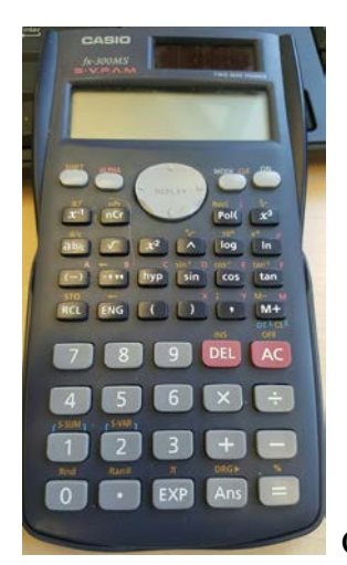
Casio Scientific Calculator

substitute for a scientific calculator. Please make a note of this.