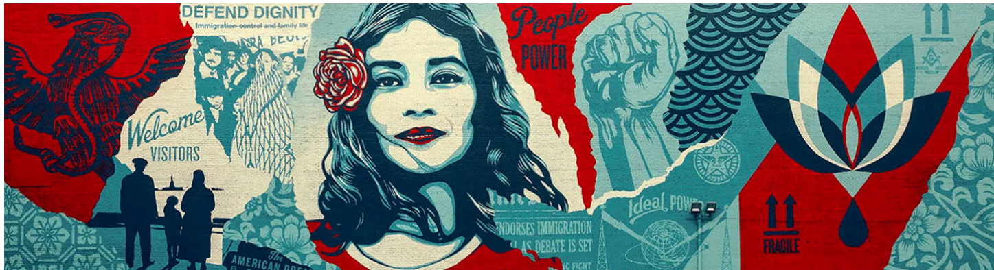
Defend Dignity , Shepard Fairey, 2019, Los Angeles Mural