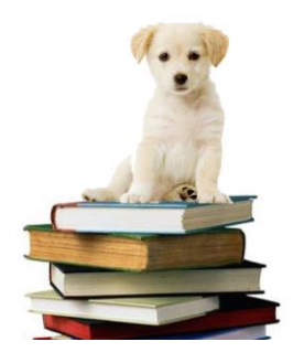
Final Exam: Friday, May 6<sup>th</sup> from 1:30-4:00 PM

Office hours: Mondays & Fridays 12:15-1:15 PM and by appt. in BAC 125. Zoom is also an option!