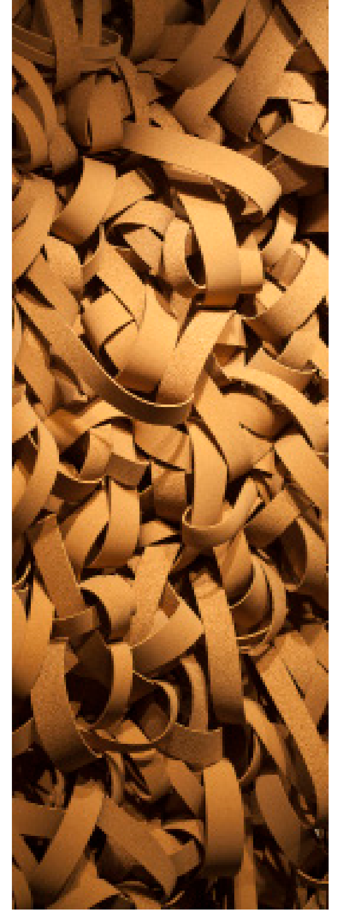
Emily Poole 2013 Keller Gallery