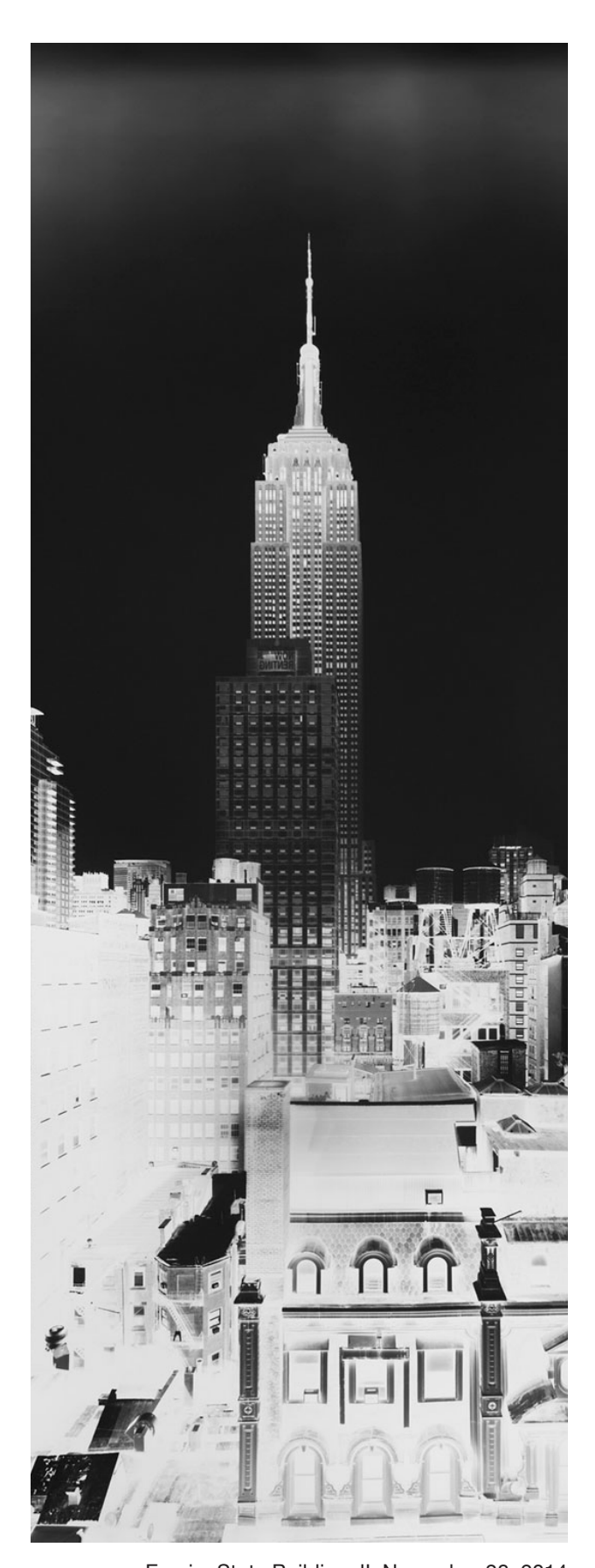
Empire State Building, II: November 28, 2014 Vera Lutter ,2014 Unique Gelatin Silver Print 91 in x 56 in